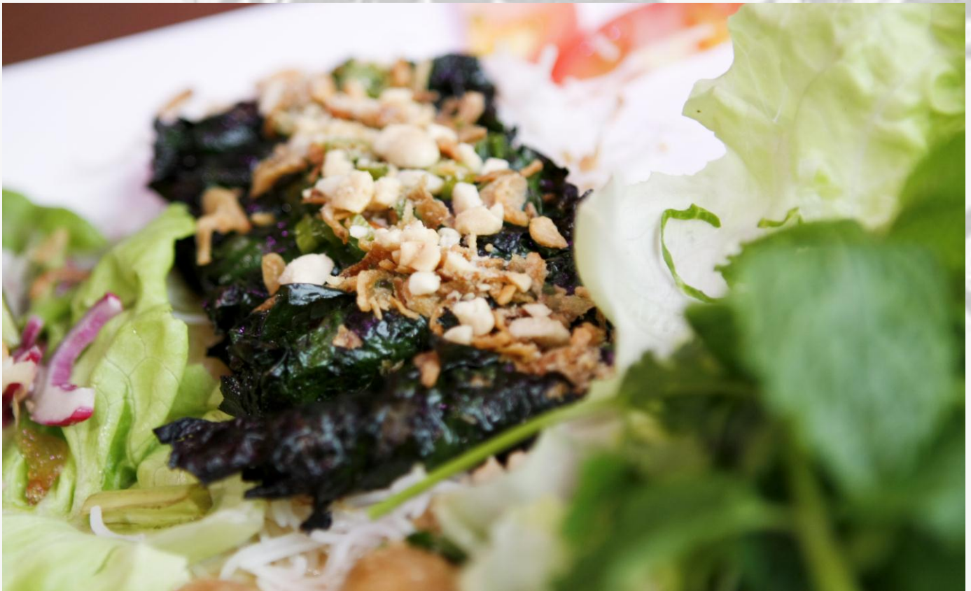
Charcoal grilled beef wrap in wild betel leaves

Our dishes may contain traces of nuts, please advise our staff of any allergies