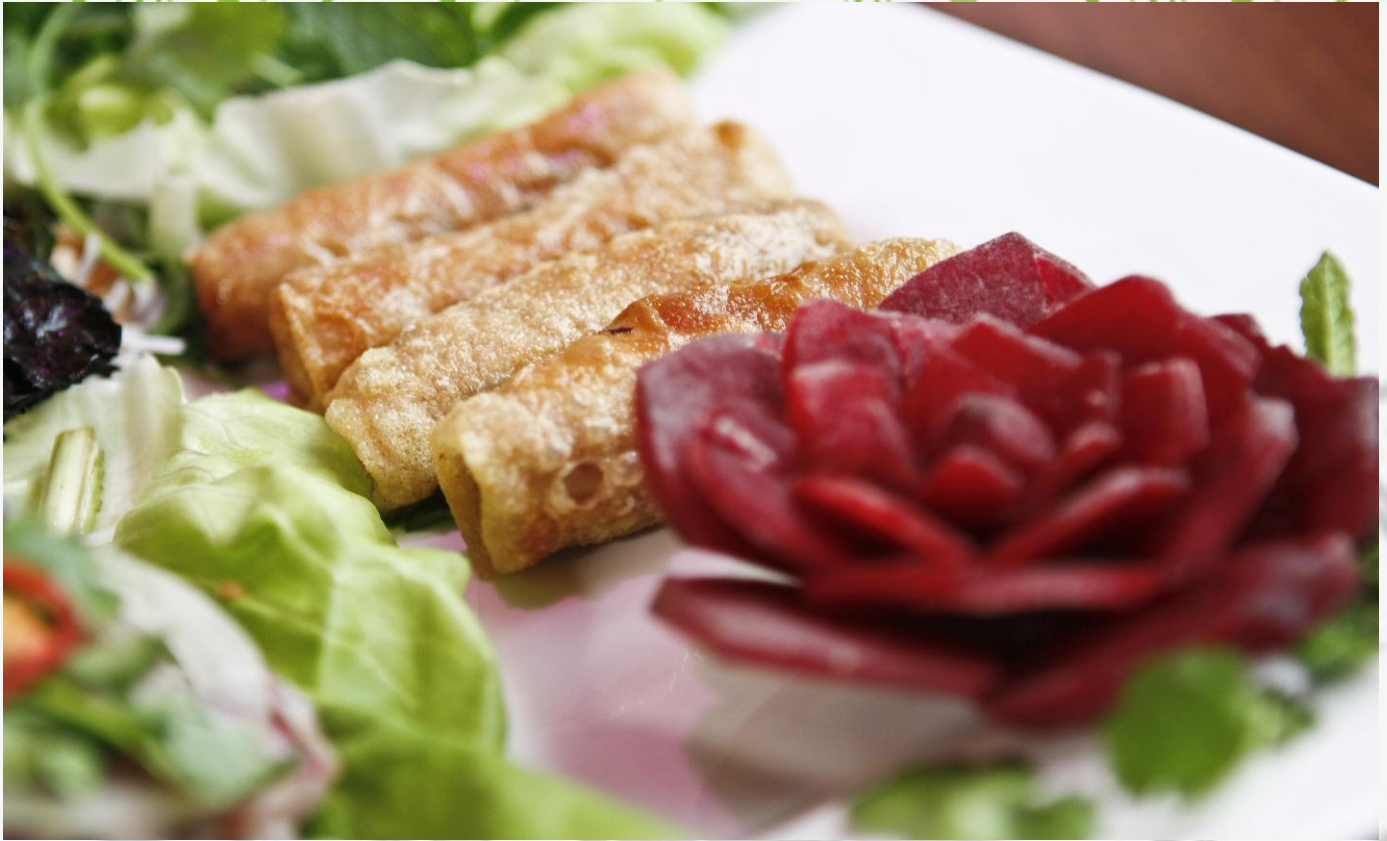
Vietnamese spring roll